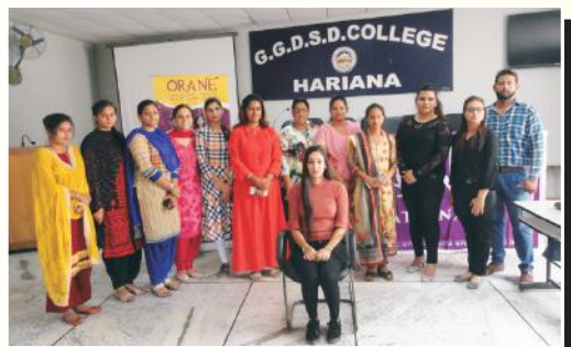
Women Cell alongwith Career Guidance Counseling and Placement Cell of our College in collaboration with Orane International School of Hair Beauty and Makeup, Hoshiarpur organized a Seminar on 'Opportunity of Employability'