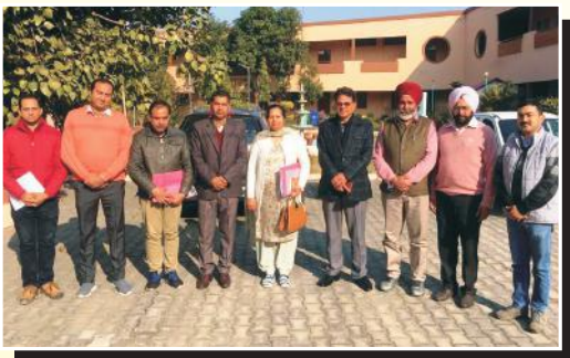
Our College signed MOU with S.D. College, Hoshiarpur and Shri Guru Har Rai Saheb College for Women, Chabbewal