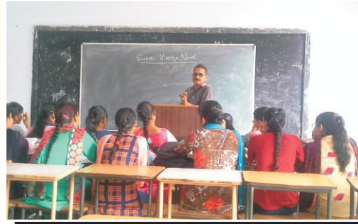
A lecture on the contribution of Swami Vivekanand organized by the Department of Political Science of the College