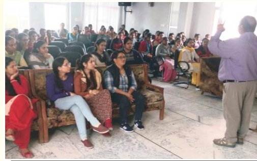
Women Cell of the College in collaboration with Social and Economic Development Centre (NGO), Ropar organized a Seminar on "Sanitation and Cleanliness".