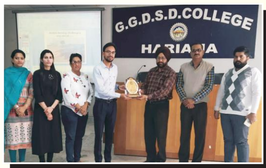
A Lecture was organized by the Department of Extension Activities to aware the students about the Drastic Effects of Stubble Burning