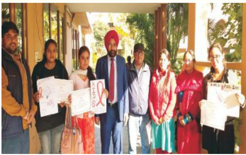
Aids Day celebrated in the College Campus