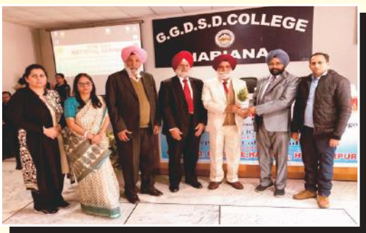
One-Day National Seminar on "Sustainable Rural Livelihood-Opportunities and Challenges" sponsored by ICSSR (New Delhi) organized by the Department of Agriculture of the College