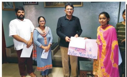
Rashtriya Poshan Maah 2019 launched by Red Ribbon Club in collaboration with NSS unit of the college. A Poster Making Competition was organized in the College