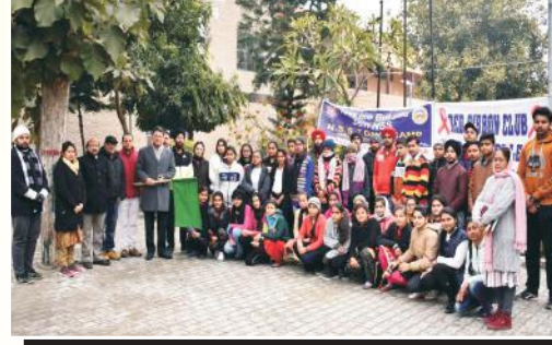
7-Day NSS Camp was organized in the College campus from 25th December to 31st December 2019