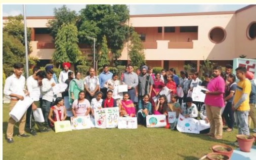
Poster Making Competition on Topic of Innovative Green Diwali was held by IIC (Institute Innovation Council) of College