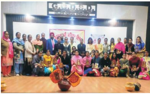
International Women's Day" celebrated by Women Cell of the College in collaboration with Department of Social Security Women and Child Development,