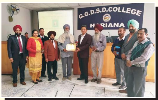
Post Graduate Department of Punjabi released a book titled "Shri Guru Nanak Dev Ji Di Baani De Mukh Sarokar", dedicated to 550th Birth Anniversary of Shri Guru Nanak Dev ji on 2nd March, 2020. S. Harjinder Singh Dhami, General Secretary, SGPC, Amritsar was the Chief Guest