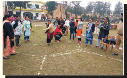
Staff Members participating in Annual Athletic Meet 2020