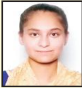
Indu BCA Sem-I 1st