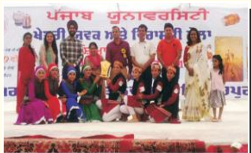
General Dance Team of our College receiving the First Prize Trophy during Panjab University Youth & Heritage Festival, 2019-20