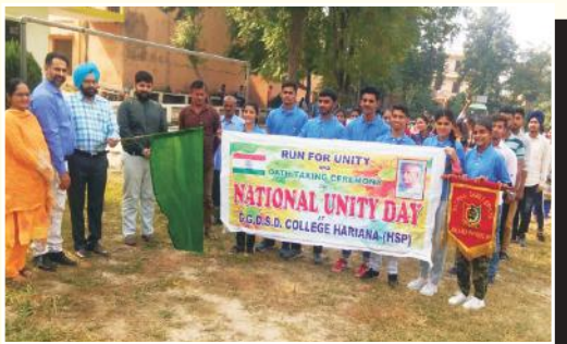
NCC Wing of the College in collaboration with 12 NCC Battalion, Punjab celebrated 'Unity Day' in the College dedicated to birth anniversary of Sh. Vallabh Bhai Patel. NCC cadets pledged for 'Run For Unity and National Integration'