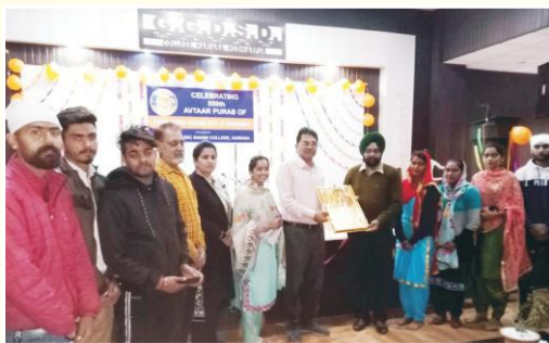
Department of Music organized a Music Concert dedicated to 550th Birth Anniversary of Shri Guru Nanak Dev ji. Shabad Gayan and Poem Recitation was done by the students