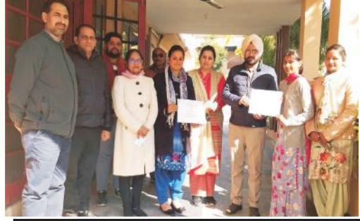
NSS Unit of the College celebrating National Girl Child Day in the College on 24th January, 2020