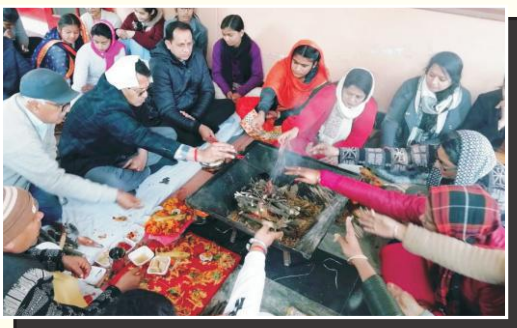
Havan' in the College campus to seek the blessings of the Almighty