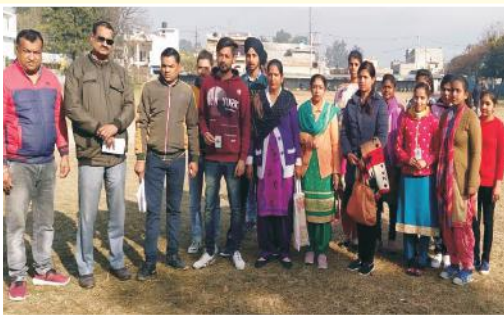
NCC & NSS Unit of the college alongwith Election Department of Hoshiarpur celebrated National Voter Day in the College on 25th January, 2020