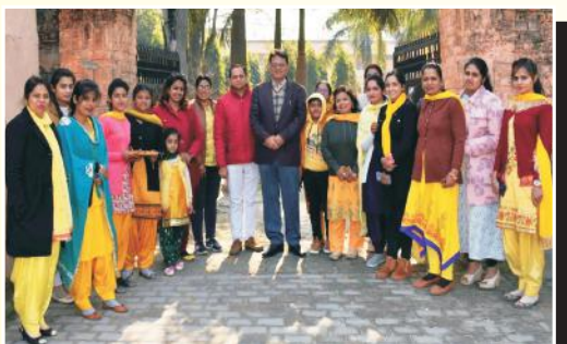
Happiness Committee of the College organized a Kite Flying Competition on the eve of 'Basant Panchmi'