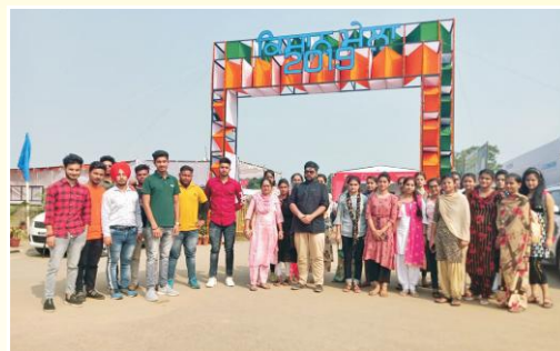
The Department of Chemistry organized a Seminar on 'Effects of Stubble Burning' in Punjab