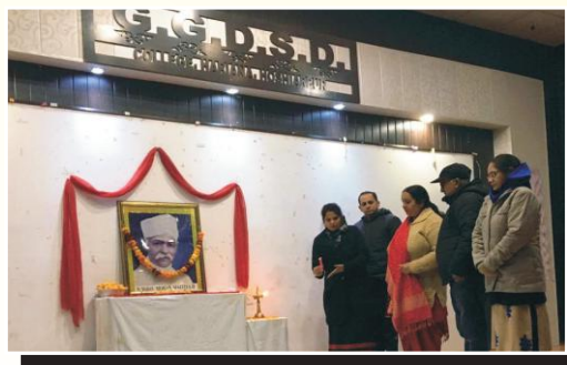
Pandit Madan Mohan Malviya's Birth Anniversary celebrated in the college campus on 24th December 2019