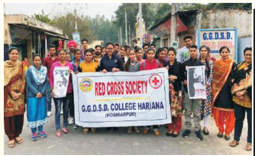
The Red Cross Society of the College organized a Rally in Haryana to aware the students and people of the area regarding 'Gender Equality and Justice' on 13th November, 2019