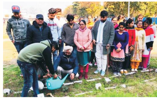
NSS Unit of the College celebrated Swachh Pakhwara in the College