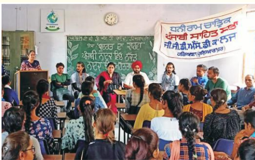
M.S. Swaminathan Society (Department of Agriculture) and Dhani Ram Chatrik Punjabi Sahit Sabha (Department of Punjabi) of the College organized a Nukad Natak performed by the artists of Theater and Television Department, Patiala on Cleanliness and Water Conservation