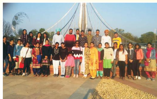
The College organized an Educational One Day Trip to Science City, Kapurthala on 2nd March, 2020