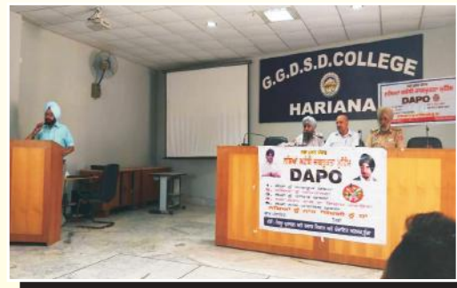
A Seminar on "Drug De-addiction" was organized in the college on 29th August, 2019