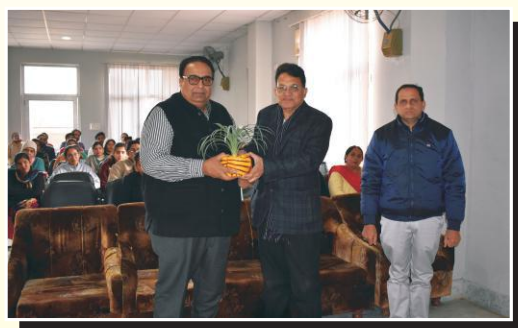
A Seminar on "Drug De-addiction" was organized in the college on 29th August, 2019