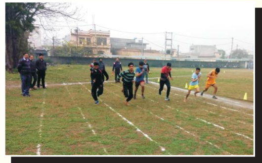
Students during Annual Athletic Meet, 2020