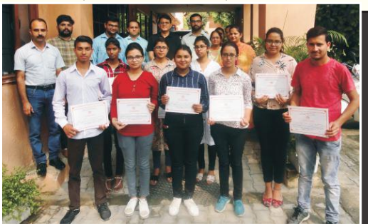
A Workshop on the topic 'Entrepreneur and Innovation' was organized by the Department of Commerce in collaboration with IIC (Institute Innovation Cell)