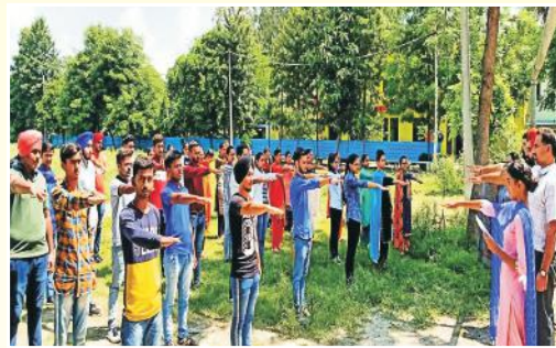
NCC & NSS Unit of the college celebrated Sadbhavana Divas in the College on 20 th August, 2020