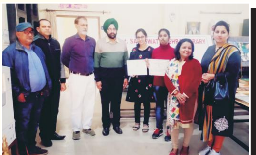
Smt. Saraswati Mishra Library celebrated National Library Week from 14-20 November, 2019. A Poster Making competition also organized dedicated to 550th Birth Anniversary of Shri Guru Nanak Dev ji