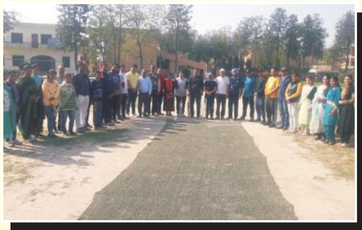
Players of Staff Cricket Teams during the Toss