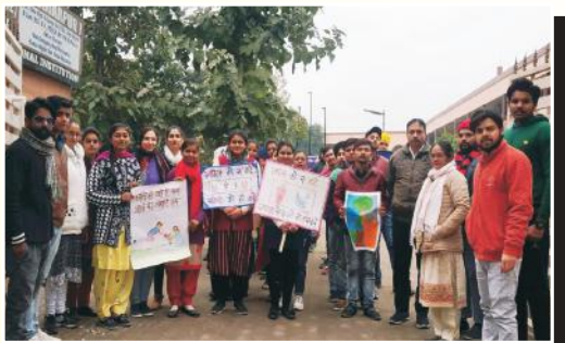
Rally regarding "Harmful Effects of Plastic Use" was carried out by NSS volunteers during 7-Day NSS Camp