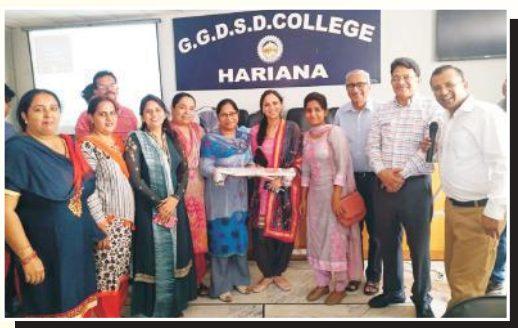
Faculty Development Programme organized on 11 th October 2019 in the College