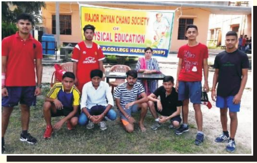
Physical Education Department of the college celebrated National Sports Day and started "Fit India Campaign"